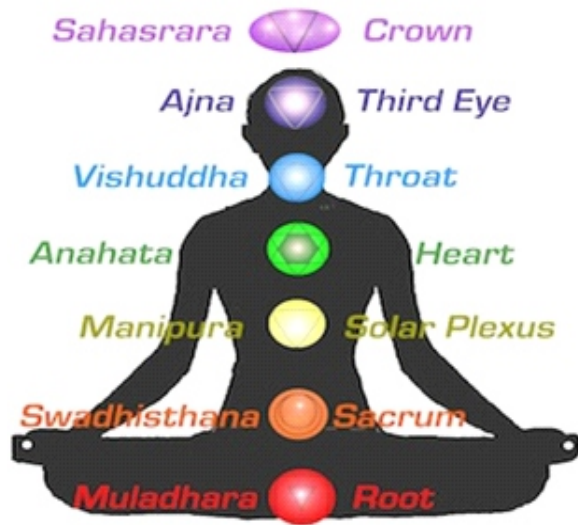
Figure 1. The 7 Chakras with Sanskrit Names

duly residing in our body running from the base of the spine to the mid-brain and one at the top of the head, acting as 'steamways' to the nervous system. These chakras, beginning from the base are called Mooladhara Chakra (Root ) associated with the reproductive system; Svadhithana Chakra (Sacral/Hara) associated with the excretory system; Manipura Chakra (Solar Plexus) associated with the skeletal system; Anahata Chakra (Heart) associated with the circulatory system, Vishuddhi Chakra (Throat) associated with the respiratory system; Ajna Chakra (Third Eye) associated with the nervous system; and Sahasrara Chakra (Crown) associated with the endocrine system. During breathing exercises, each chakra indirectly affects the physical and the mental domains of the individual undergoing the healing therapy.